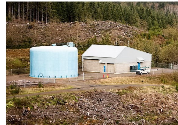
Youngs River Lewis & Clark Treatment Plant