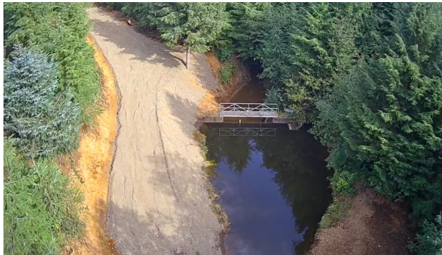
South Fork Barney Creek New Access Road Project

(4) Lead. Infants and children who drink water containing lead in excess of the action level could experience delays in their physical or mental development. Children could show slight deficits in attention span and learning abilities. Adults who drink this water over many years could develop kidney problems or high blood pressure.