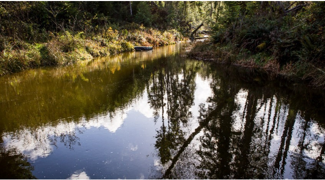
South Fork of Barney Creek Intakes