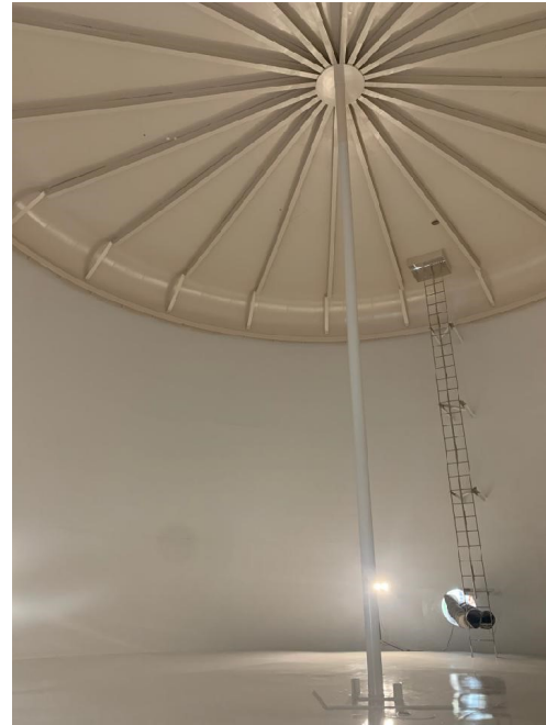
New Coating Inside 400,000 Gallon Clearwell Tank Completed Fall of 2021

(4) Lead. Infants and children who drink water containing lead in excess of the action level could experience delays in their physical or mental development. Children could show slight deficits in attention span and learning abilities. Adults who drink this water over many years could develop kidney problems or high blood pressure.