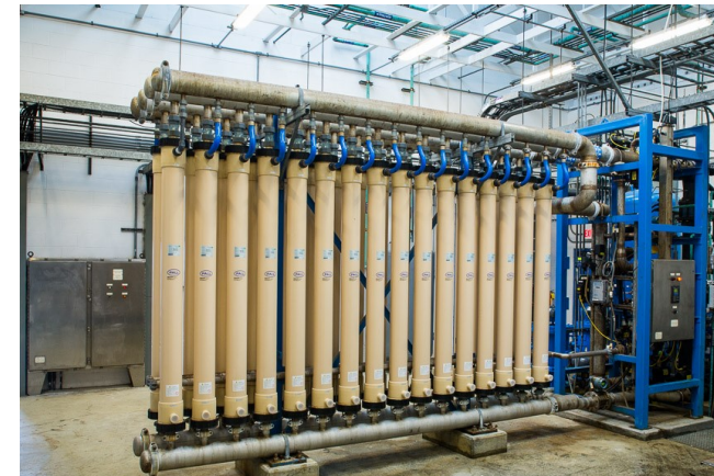
Youngs River Lewis & Clark Treatment Plant